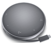
DELL MOBILE SPEAKERPHONE | MH3021P

Designed to work seamlessly across 3 devices, this compact keyboard mouse combo keeps your desk clutter-free and lets you stay productive with up to 36 months 25 of battery life.