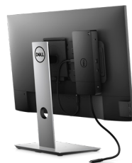
DELL DOCKING STATION MOUNTING KIT | MK15

Work at full speed with Dell's powerful Thunderbolt Dock. Charge your system faster, support up to two 4K displays and connect to your peripherals via a single cable.